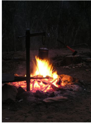
McKillops camp fire