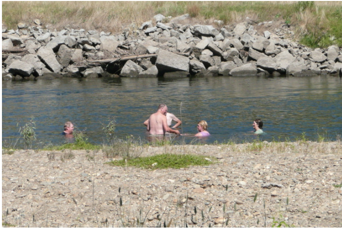
Murray River – Clarke Lagoon

mystery object which resulted in all the girls leaving the water quickly, only to return when all was declared safe. After swimming, it was time for nibbles and drinks, before finding the energy to get dinners ready. A fine balmy night by the river.