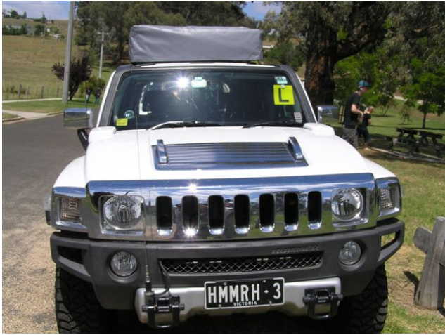
James learning machine.