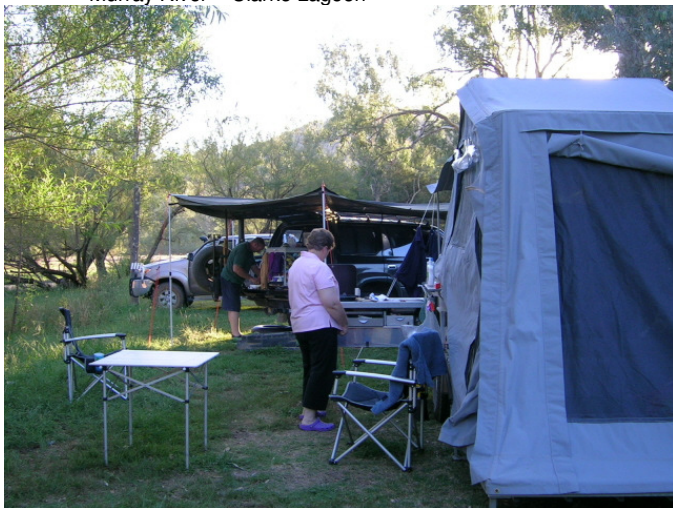
Time for dinner – Clarke Lagoon