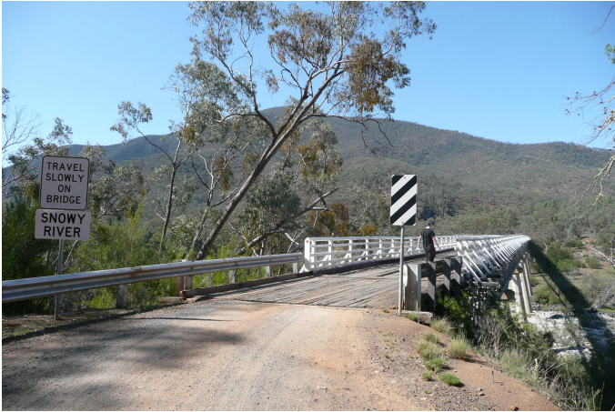
McKillops Bridge west side

Walk down to the bridge, lots of photos taken then back to camp to get dinner ready.