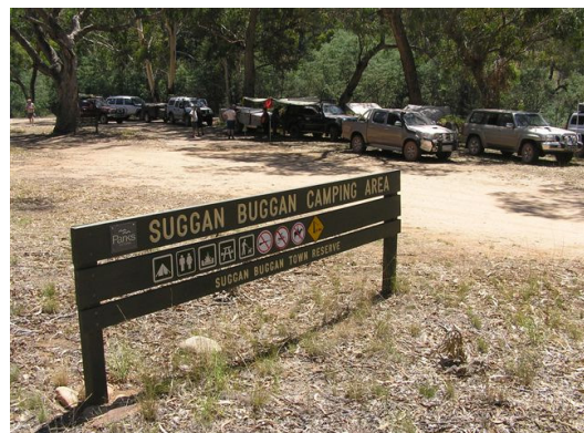
Suggan Buggan lunch stop