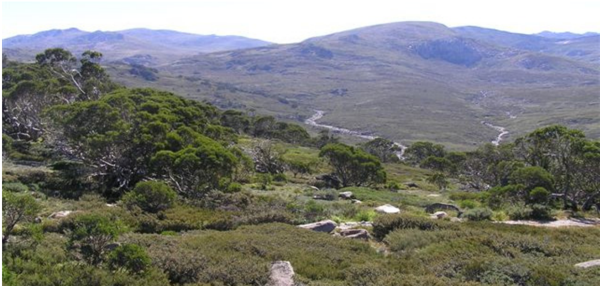
Headwaters of Snowy River, Kosciusko off to the left.

Next morning off to Jindabyne. Back up to Wheelers Saddle and out to Wulgulmerang with a quick stop to look at Little River. Head up the road to Suggan Buggan for lunch. From Suggan Buggan, followed the Barry Way along the Snowy River to Jindabyne. Plenty of great looking camp sites on NSW side along the river. Arrived Jindabyne Holiday Park around 15:00 hrs, set up camp, (it's bloody hot!!) and back into the cars for a quick run up to Charlottes Pass and a look at Kosciusko and the head waters of the Snowy River.