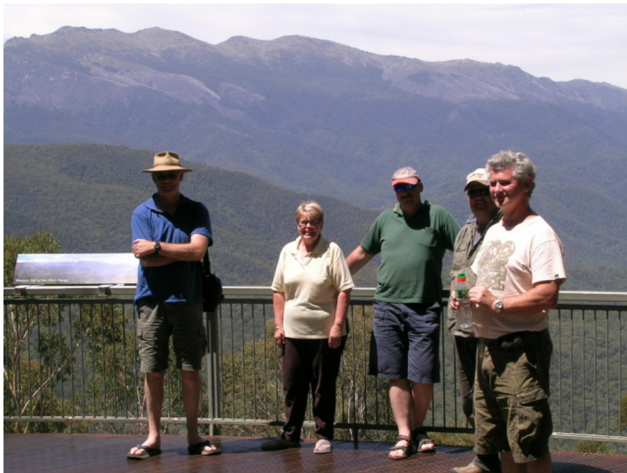
Scammells Ridge Lookout