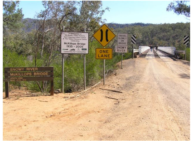
McKillops Bridge East side

Next morning off to Jindabyne. Back up to Wheelers Saddle and out to Wulgulmerang with a quick stop to look at Little River. Head up the road to Suggan Buggan for lunch. From Suggan Buggan, followed the Barry Way along the Snowy River to Jindabyne. Plenty of great looking camp sites on NSW side along the river. Arrived Jindabyne Holiday Park around 15:00 hrs, set up camp, (it's bloody hot!!) and back into the cars for a quick run up to Charlottes Pass and a look at Kosciusko and the head waters of the Snowy River.