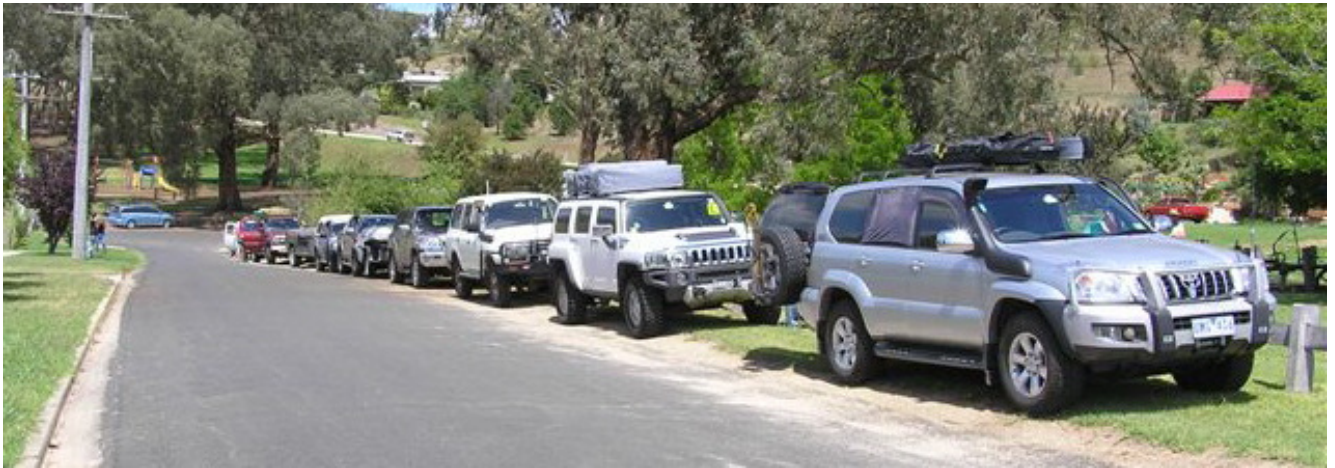
Lunch stop at Buchan

After lunch on to McKillops Bridge. The run went well up to Gelantipy along the bitumen, up past Seldom Seen and the turn off to McKillops. Onto the gravel, up past Little River Gorge and onto Wheelers Saddle, all on a narrowing mountain road. Wheelers Saddle to McKillops – 11 km of narrow, winding, single car width gravel road, which had some shifting in their seats.