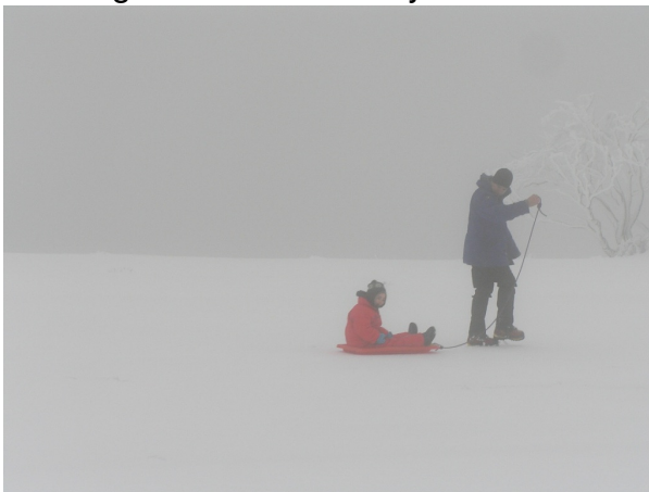
Rachel Owen on the toboggan

Reaching the Summit of Mt. Skene about 4 ½ hours from the camp site we realized that to head back, through the same and potentially time consuming terrain it was likely to be well after dark.