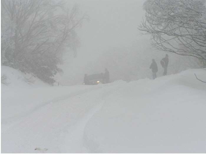
Preparing to recover