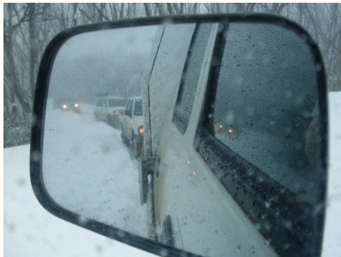
Convoy near Mt Skene Summit

Some vehicles were able to recover themselves by winching out and others were towed out. The opportunity to practice recovery techniques in a clean, although cool, environment was invaluable. At times, winching from one tree, then relocating the anchor to another tree to obtain sufficient distance to pull clear of the soft snow.