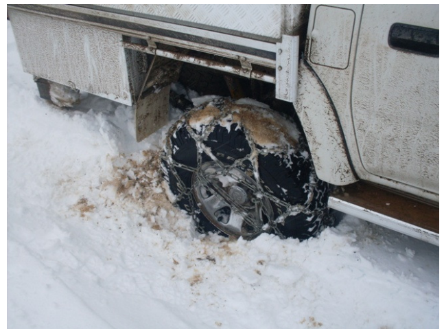
Snow chains can dig a hole when trying to recover another vehicle

After spending a short time on the toboggans, we decided to head onto Granny's Flat Camp ground, just out of Jamieson.