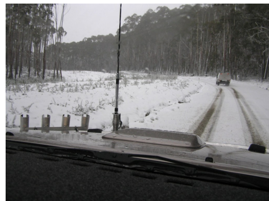
Warburton-Woods Point Rd

After travelling in snow covered roads for about 2hours, we reached Connors Plain camp ground. The camp area was covered in snow. The plan was to head upto Mt.Skene summit and then return to the camp ground for the night. Last year, the journey upto Mt.Skene summit took about 30minutes.